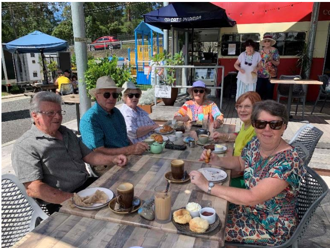
Red Bus Brunch