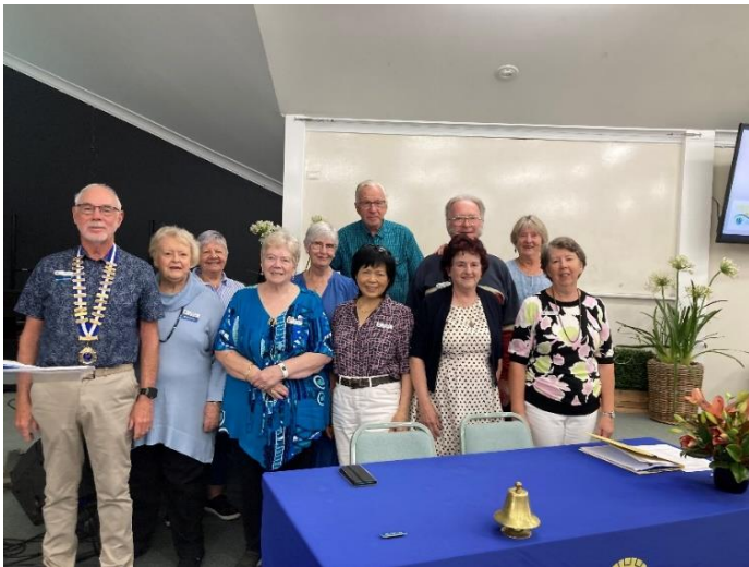
2025/2026 Committee Members